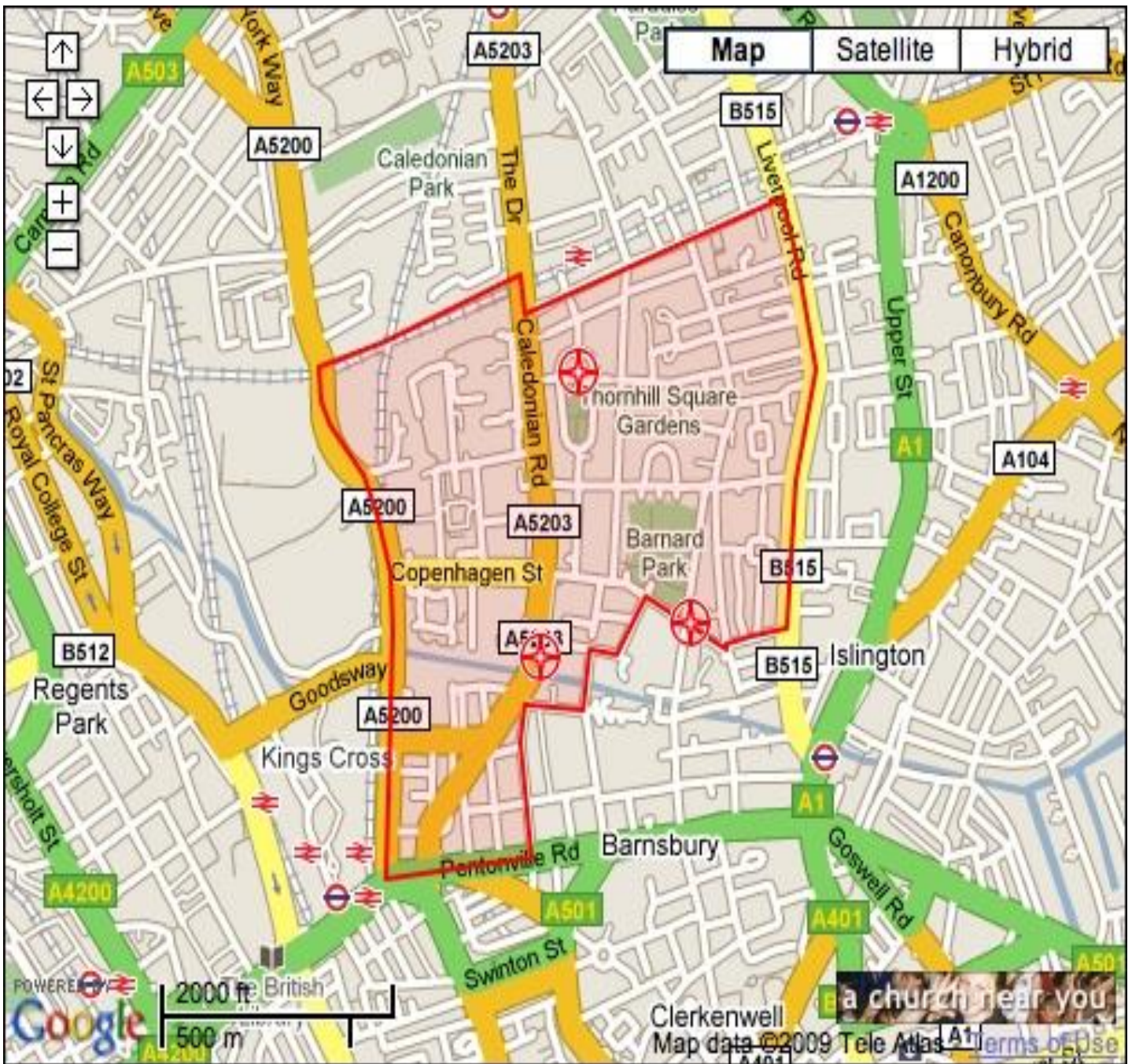
Maps showing the Barnsbury Parish Boundary